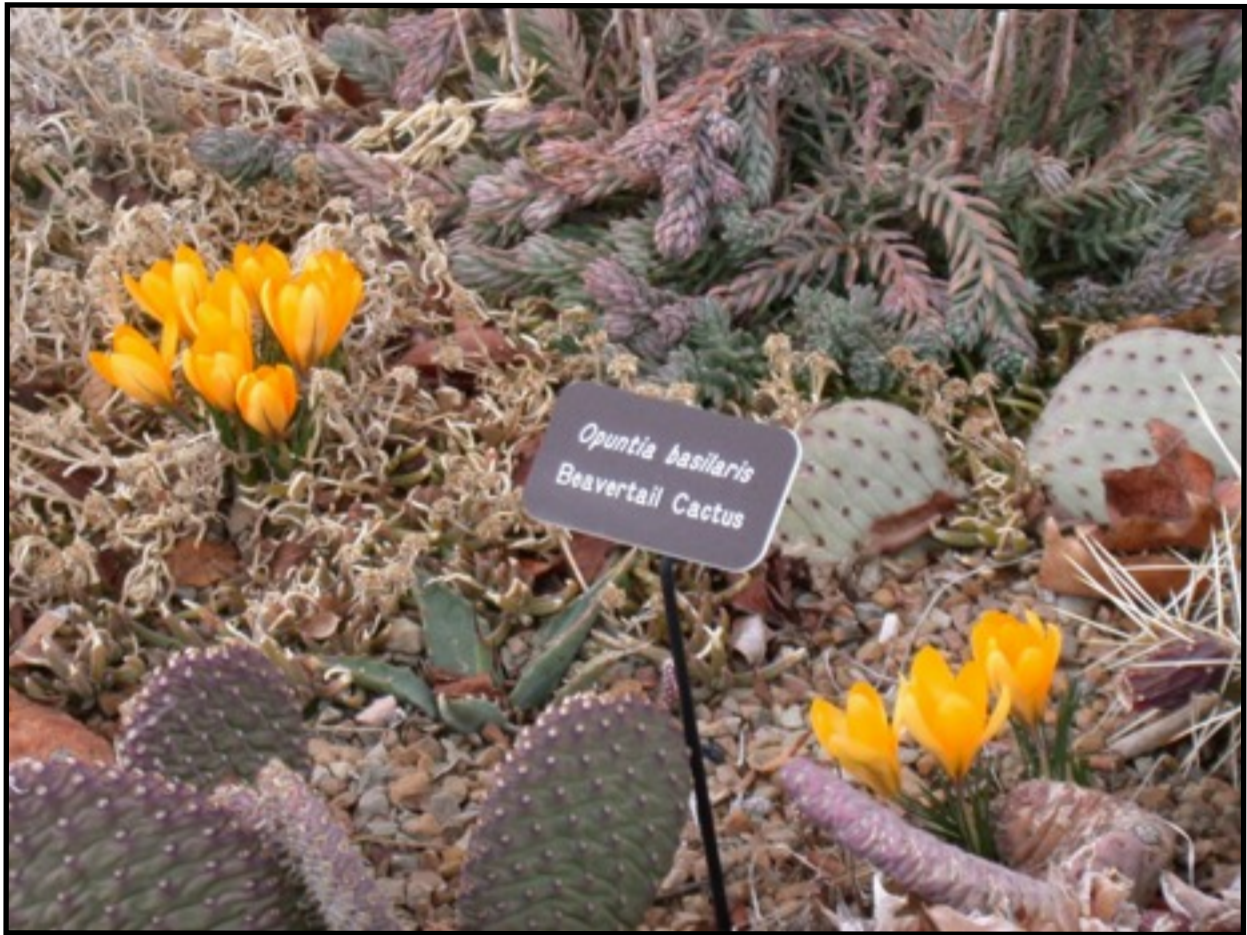
Crocus a-bloom amid the Opuntiae!