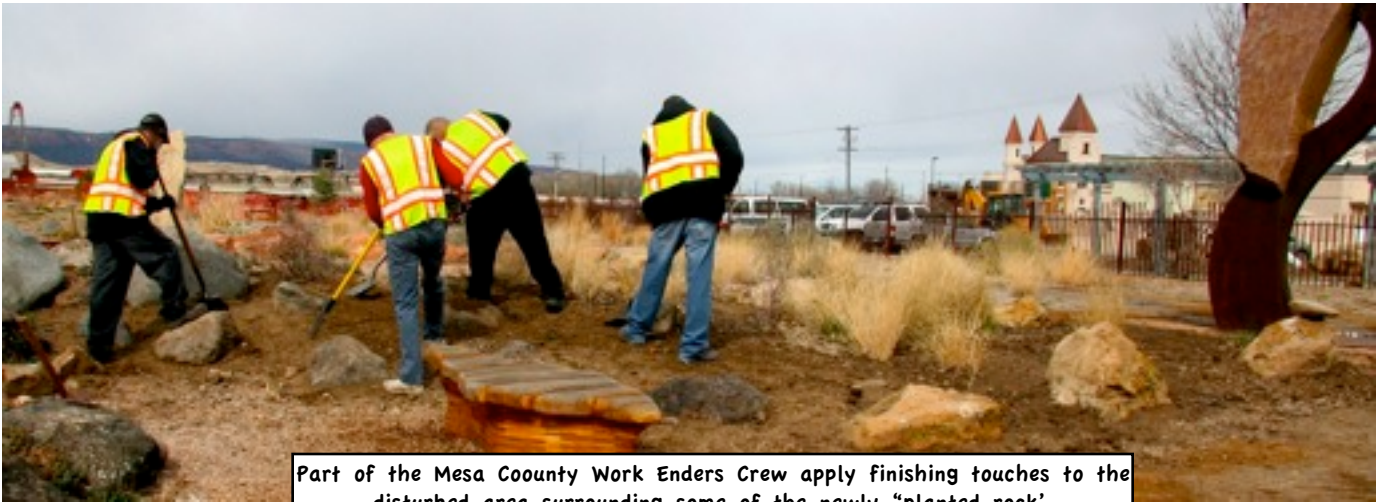
Part of the Mesa County Work Enders Crew apply finishing touches to the disturbed area surrounding some of the newly "planted rock".

In 2002 we had some very good assistance from a similar crew during installation of the original garden. The guys pictured at the top of this page were an especially effective crew. They worked hard, quickly grasping the concept of making the newly 'planted' rocks look 'natural'. Their strong backs and cheerful willing attitude are greatly appreciated.