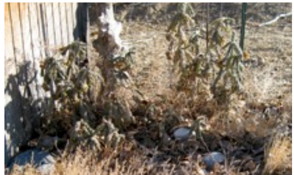
Examples of Cholla available for harvesting.