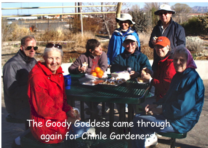
The Goody Goddess came through again for Chinle Gardeners!