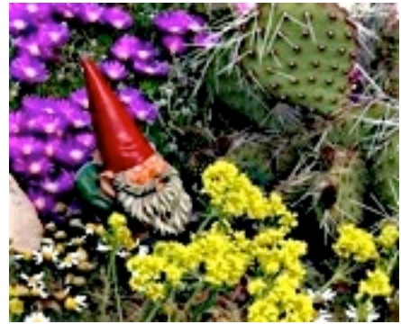
Here Norman infests the C&S Garden at the Mesa County Fairgrounds.