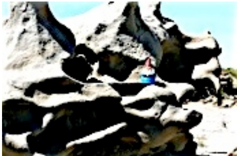
Siggie visits Fantasy Canyon!