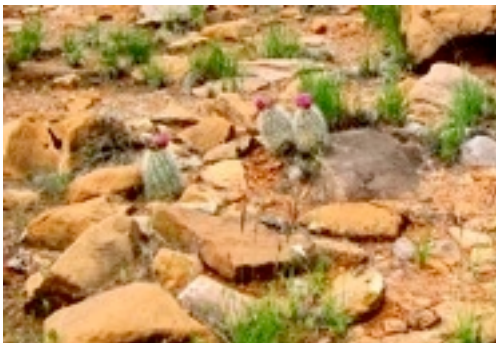
Examples of the large flowering Sclerocactus parviflorii harvested for the WCBG and CSU gardens.

in Fruita, CO, wrote the Club and Morgan Williams of Flux Farms, "Many thanks to you and the other volunteers for collecting the cactus today. They look really good. We will plan to plant them in a couple of weeks. Thanks for your support and participation."