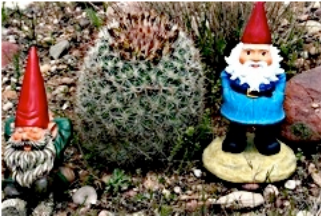
Norman and Sigfreid tag-team this giant yellow pediocactus .

Those of you who wish to learn more about this dreadful pest can view additional information by going to U-Tube, and searching for "Gnome Management in the Garden." This is something EVERY gardener needs to view--and be prepared for.