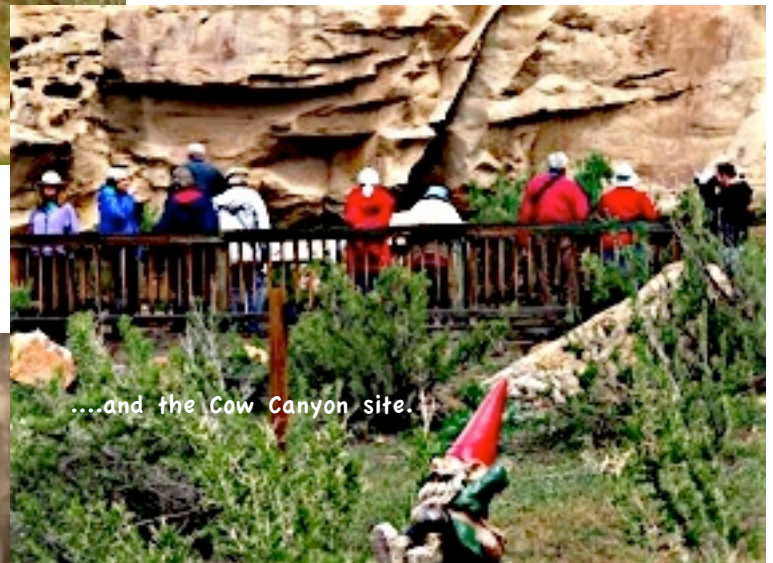
....and the Cow Canyon site.