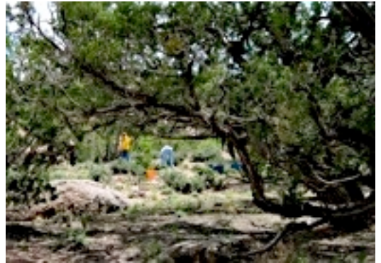
The group finds a lush growth of opuntia in the Gateway area.