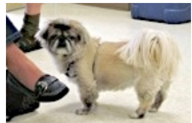
Curtis Swift's buddy especially enjoyed the program!