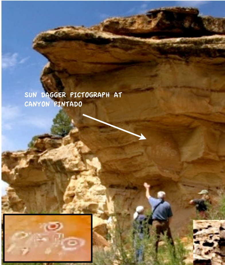
SUN DAGGER PICTOGRAPH AT CANYON PINTADO