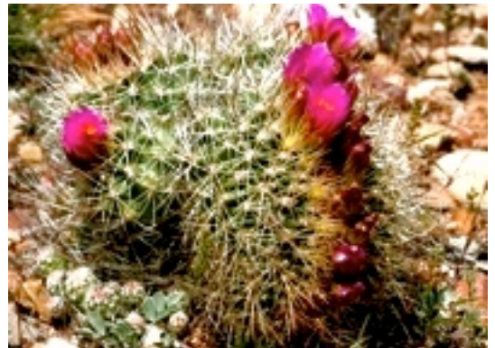
What a find!! A crested Sclerocactus wetlandicus in bloom!

After an early lunch, the next destination was a visit to a special area with Opuntia and