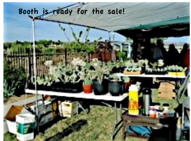
Booth is ready for the sale!

by coffee and donuts brought by the Hassell's and the Benoit's, members unloaded plants and set up the tables.