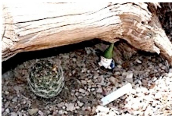
A new species of gnome has emerged in Orchard Mesa threatening a pediocactus .