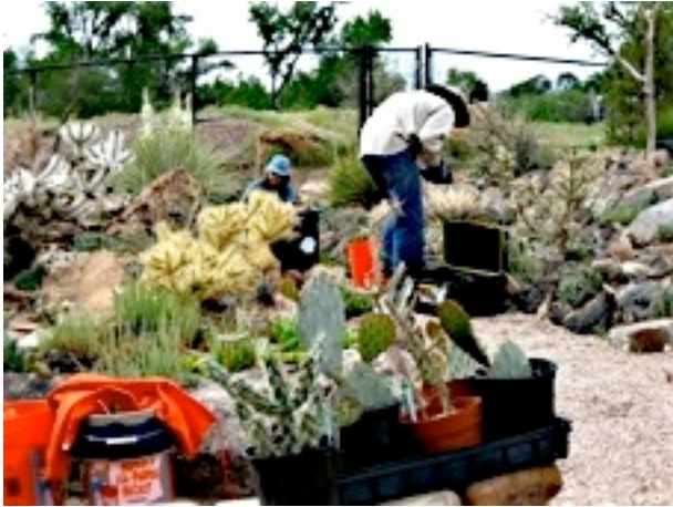
Plants waiting patiently to be planted!