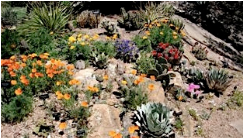
Dryland Mesa RIGHT NOW!