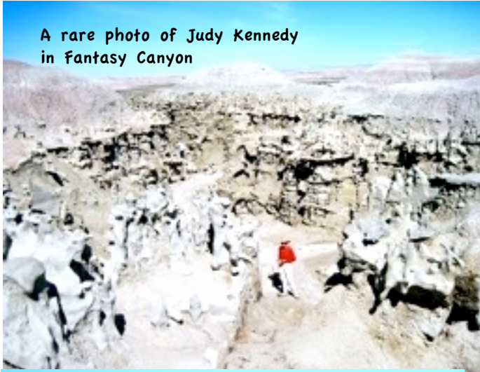
A rare photo of Judy Kennedy in Fantasy Canyon