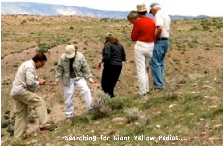
Searching for Giant Yellow Pedios....

After negotiating Douglas Pass, the tour group entered Canyon Pintado, and stopped at several of the rock art sites that are located on this stretch of CO 139. Opuntia (“Prickly Pear”) and Echinocereus