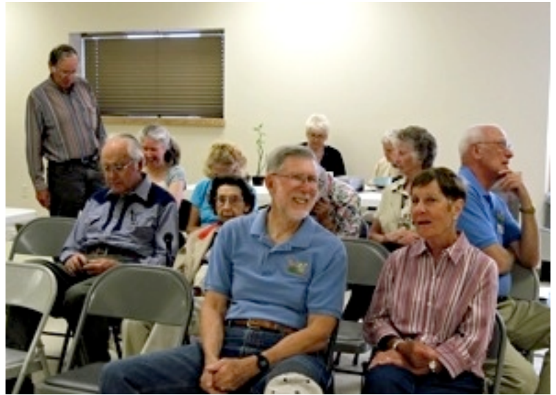
Chinle Members eagerly wait for the "show" to begin.