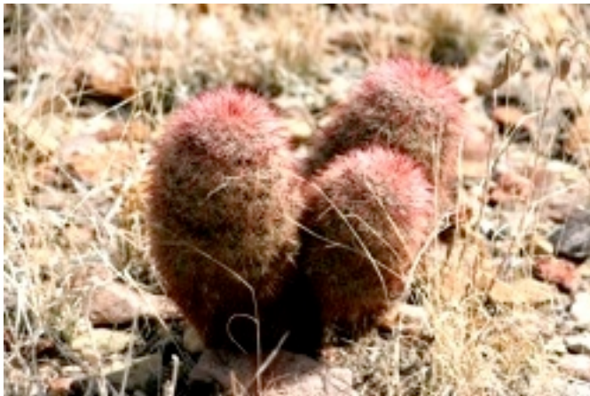
The Texas Rainbow Cactus, very common in the park.