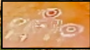
Inset: Detail of the Sun Dagger rock art