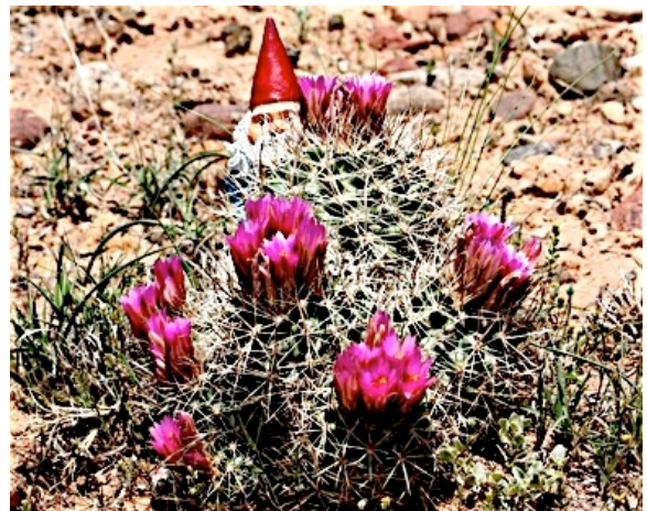
Peering over an endangered S. wetlandicus in northeastern Utah.