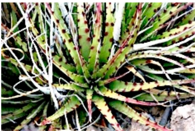
The Hechtia texensis plant, a relative of the pineapple, seen in Big Bend.