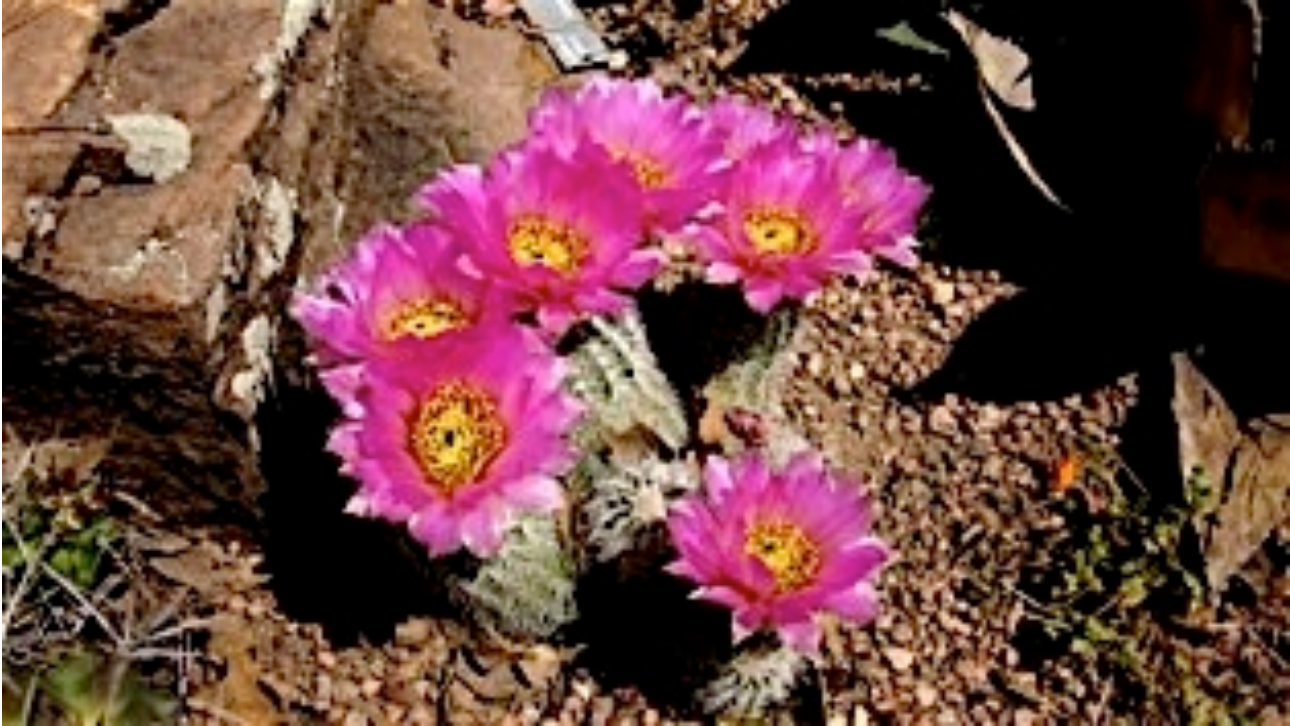
Echinocereus reichenbachii var. albispinus

Sorry: you'll miss this one. It only blooms like that ONE DAY a year, and that day was this past Monday. But it has cousins around the garden that will wait for your visit... provided you come quickly!