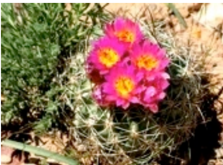
More brilliant blooms!

Sclerocactus wetlandicus, the latter being on the endangered species list, in northeastern Utah. The Sclero's were in full floral attire, showing off their beautiful, intensely pink blooms, and various sizes from very small to very large. This site was a fitting finale to a wonderful tour experience.