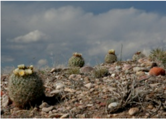
Four 'Giant Yellow Pedios' milling about on a high point overlooking the Green River in eastern Utah.