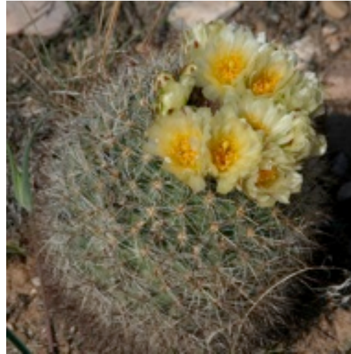
Close up of a contented 'Giant Yellow Pedio' basking in the afternoon sun.