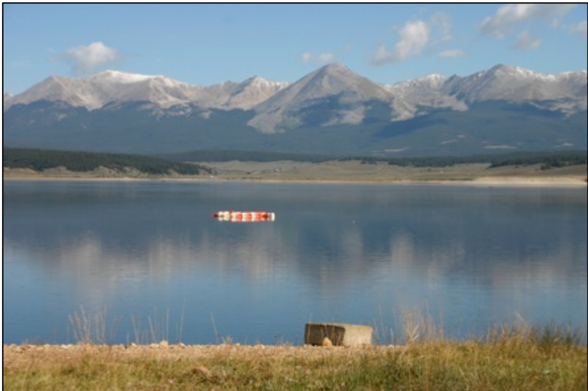
Taylor Reservoir with Elk & Collegiate Mountains in the background.