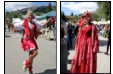
Red Mountain “Queens” in Crested Butte, 2010 & 2011