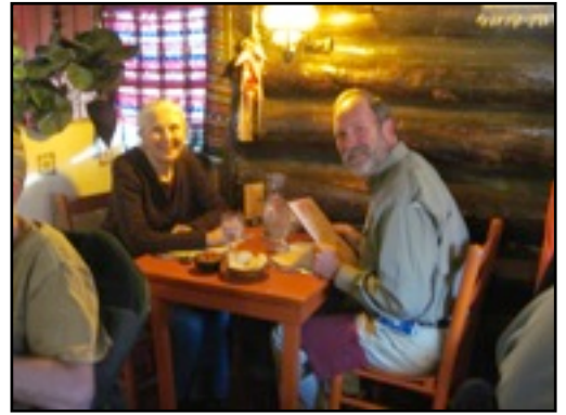
Happy faces and delicious food at the Casa Del Sol in Buena Vista.

Dinner at the Casa Del Sol restaurant was delicious and cozy. Everyone went back to their motel rooms having pushed the limits of “fullness”, but thoroughly enjoyed the evening.