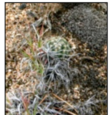
A pediocactus simpsonii nestled by a rock.