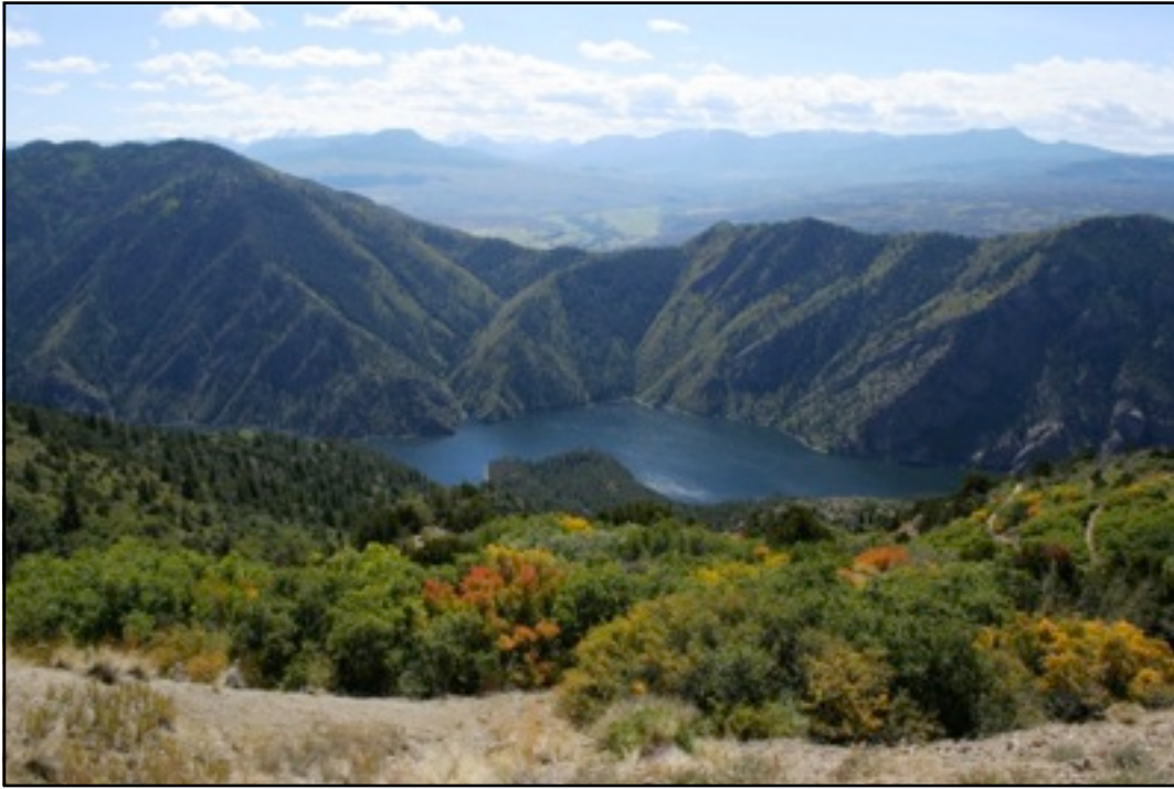
Tom Burrows photographed this awesome view on Hwy 92 near Gunnison.