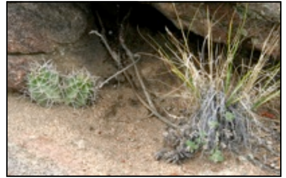
E. triglochidiatus at the Midland Hill site.