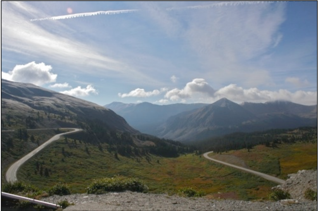
"On a Clear Day, you can see forever" at the top of Cottonwood Pass.