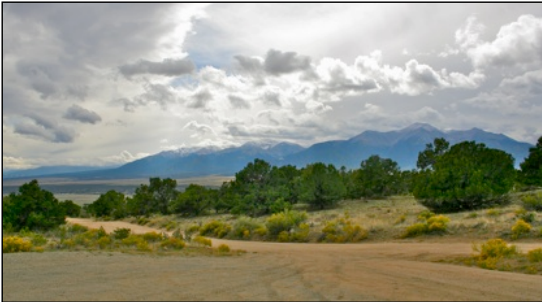
From Midland Hill just east of Buena Vista, the Collegiate 14-ers are magnificent.