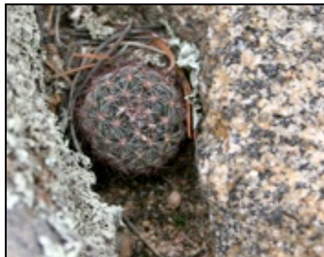
Escobaria vivipara .