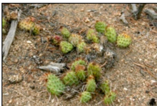
Opuntia heacockiae with its unique spines at Midland Hill.