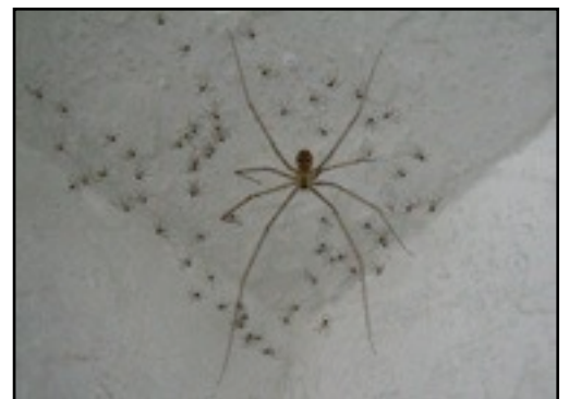
"Mother Cecilia" and her little arachnoids!

"This routine continued for weeks and months. And then, one day I noticed another ceiling spider, obviously named Cecilia, in a corner directly opposite Cecil's corner. Sometime later, when I wasn't looking, Cupid apparently visited the darkened bathroom and worked his special magic."