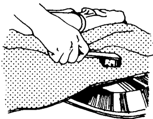
Illustration: tamping a stain with a brush.