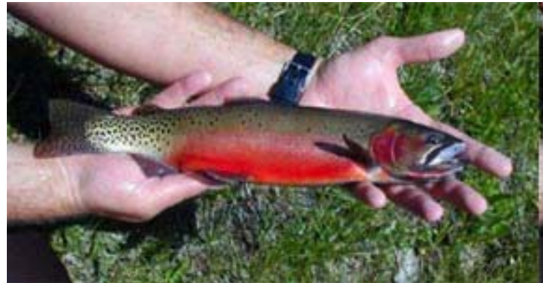
Rio Grande Cutthroat Trout