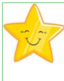
New 4-H Agent Star!