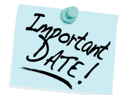
Table Top Clean Up Day

El Paso County Fair Exhibit Day has changed from Saturday, July 19 to Friday, July 18.